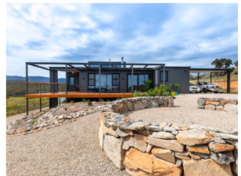
THISTLE HILL LIGHT HOUSE ARCHITECTURE & SCIENCE