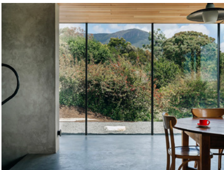
CASCADE HOUSE CORE COLLECTIVE ARCHITECTS