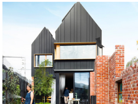
THE HÜTT 01 PASSIVHAUS MELBOURNE DESIGN STUDIOS (MDS)