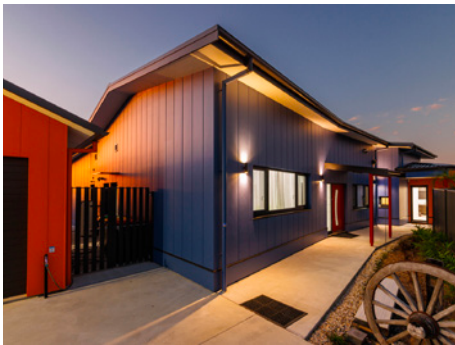
BALLINA HOUSE 6848 BLUKUBE ARCHITECTURE

The design and construction of a single-residential building to which a Class 1a Building category.