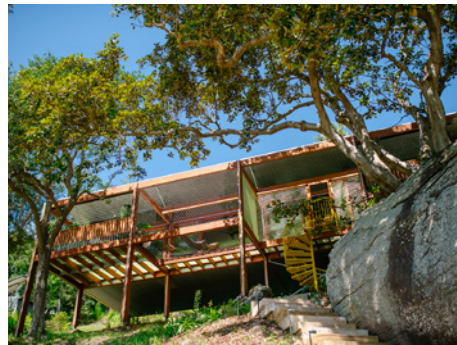
BALMY PALMY HOUSE CPLUSC ARCHITECTURAL WORKSHOP